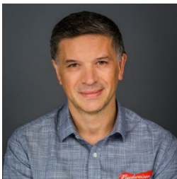
Michel Doukeris Chief Executive Officer, AB InBev

We expect all our colleagues and partners to uphold the principles outlined in the RMCC. It is part of our strong commitment to corporate responsibility that dates back over a century. As owners, we all have the responsibility to do things the right way. Together, we can create a future with more cheers.